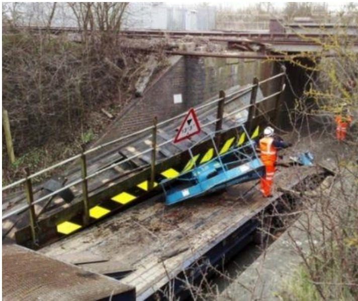
The truck caught part of the bridge as it came out

The boom lift, a Genie S-65 owned by local rental company Easi-Uplifts was on the back of a low-loader and stowed correctly. It apparently went under the first bridge which has a 13ft 3inch clearance-height with no problem, but caught the second bridge, which has the same clearance height as it came out from under it.