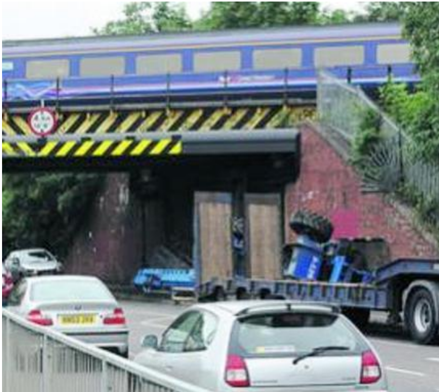
The scene yesterday

No one was hurt in the incident and damage appeared to be limited to the boom lift. There was however considerable disruption to traffic while the unit was recovered from the scene.