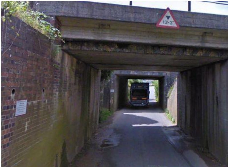
The Fenny Compton rail bridges prior to the accident

Locally there were suggestions that the bridge which came down had been subjected to earlier damage that might have reduced the clearance height.