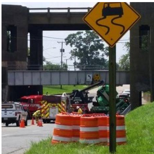
The lower bridge is supposed to have a clearance of almost 4.2 metres

The bridge is supposedly over four metres high (13'8"), which should have provided sufficient headroom as the stowed height of the machine is around three metres.