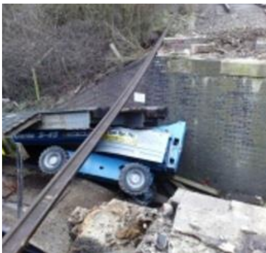
The boom appears to have been stowed correctly

No one was injured in the incident and the damage was limited to the machine and the bridge which carries a disused railway line. The active railway line running on the first bridge was undamaged and trains have apparently continued to run.