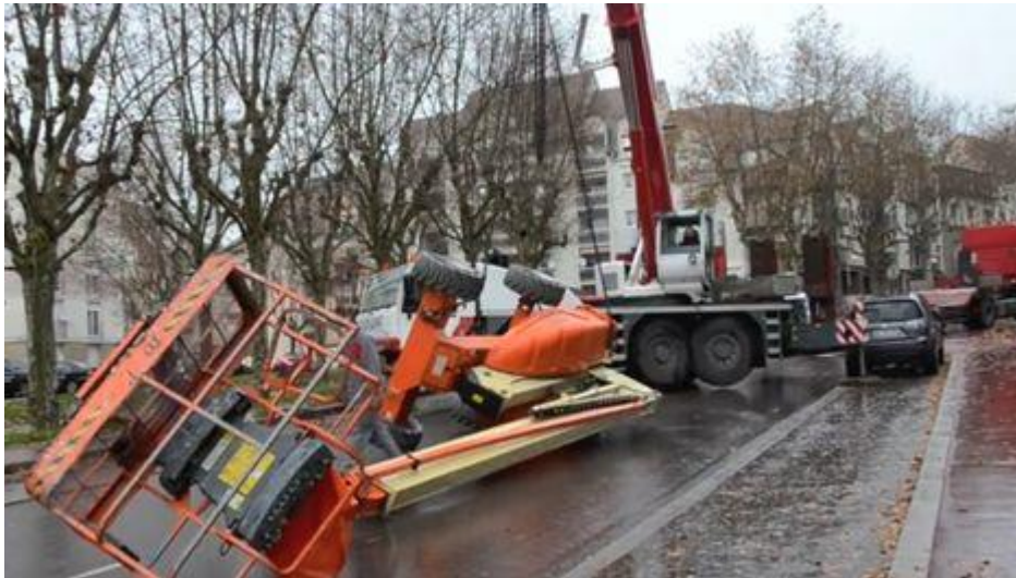
The overturned lift - note the delivery vehicle in the background

A man was injured when a boom lift overturned in Le Creusot, France on November 21 st . Exactly how we are not completely sure and so far have been unable to confirm any details.