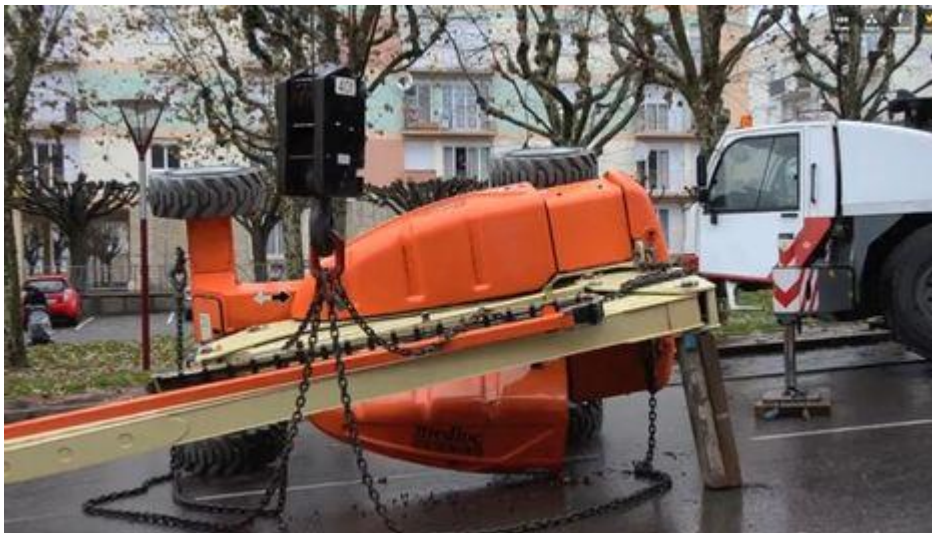
Halfway up and blocked for re-rigging

We believe that the lift, a 60ft JLG M600J owned by Medloc of Montceau Les Mines, was being unloaded from a trailer in the street when it slipped off the side and overturned, injuring the delivery driver/operator.