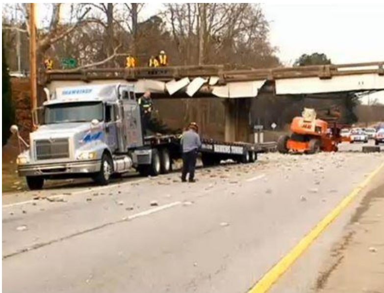
The truck looks as though it was from a third party hauler

The bridge section has now been removed and the Interstate reopened. Police said that the driver of the tractor-trailer has been charged with discharging his load on the highway.