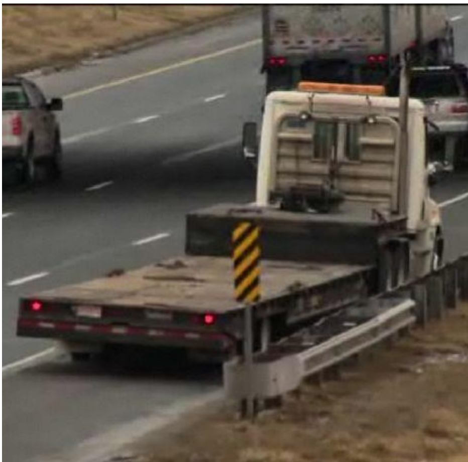
The delivery truck

The lift looks like a JLG 600AJ and is owned by local company Air Worx, how it was high enough to strike the bridge is uncertain.