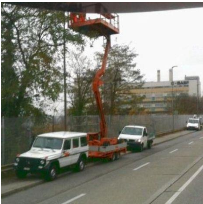
The Speed Level trailer lift

However when the user got to the run of trees he needed to work on he simply pulled his four by four and trailer up onto the kerb, started the lift and rather than unload it, proceeded to use it from the back of the trailer.