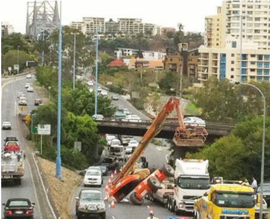
The boom lift was just high enough to catch the bridge

The incident happened in Brisbane, Australia at Kangaroo Point. The overpass was damaged but there were no injuries and no damage to any other vehicles.