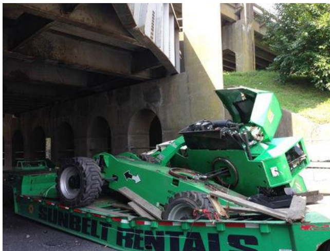
The superstructure is ripped off

The unit, a relatively new JLG, is owned by Sunbelt Rentals and is the delivery rig. The driver suffered from minor injuries in the incident. The bridge was damaged and the road was closed for some time while a large oil spill was cleaned up and the truck removed.