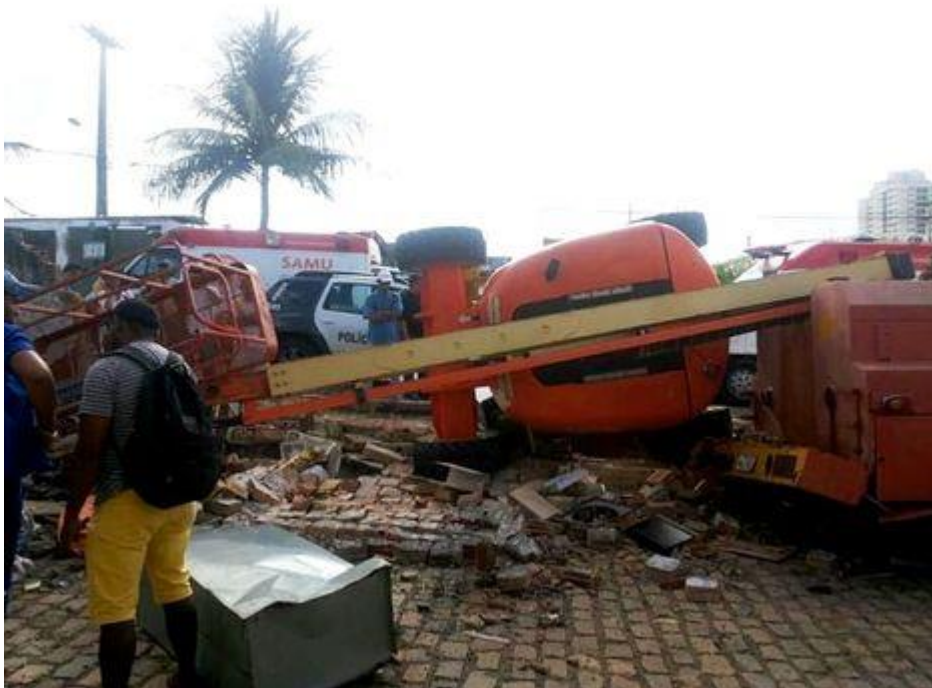
The overturned boom lift