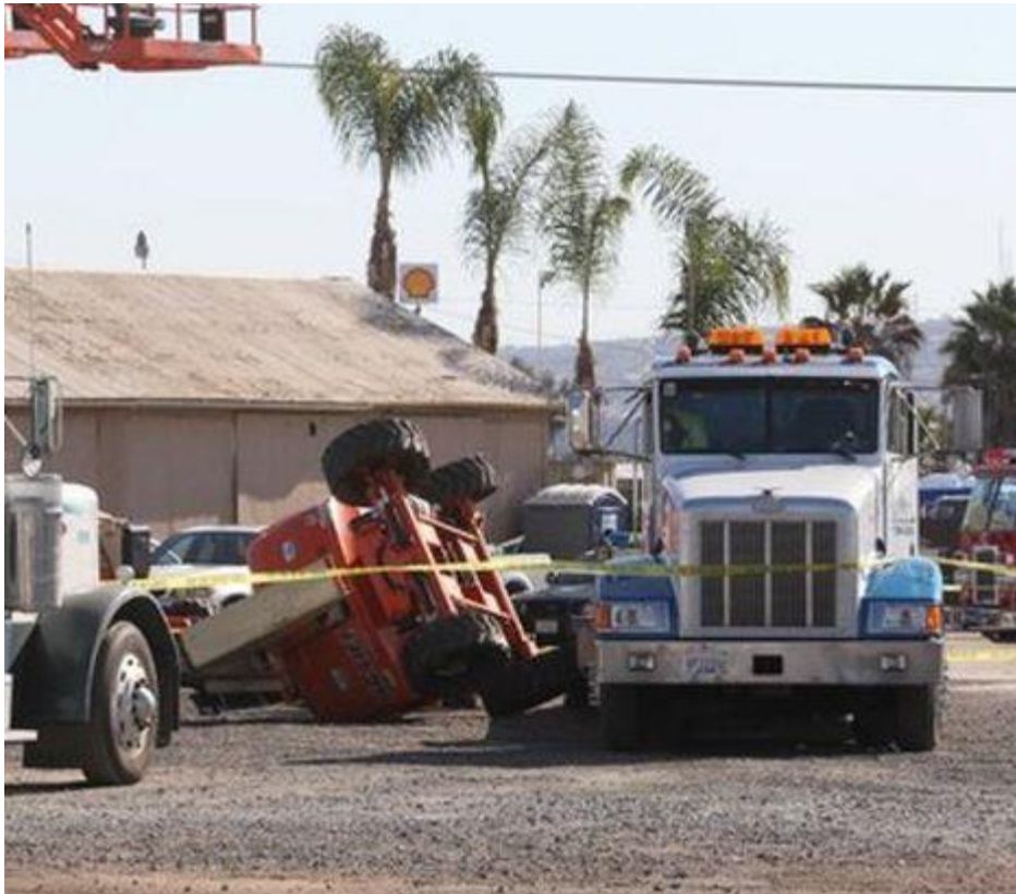
The boom slipped off the side of the low loader

The incident occurred in the Palm City area of the city. The man, who would have been 59 on Saturday, landed on his head when the machine went over. We do not know if he was thrown from the platform or managed to hit his head from within the basket.