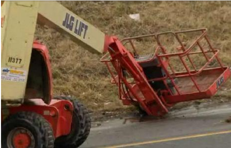
Repairs will be costly

The lift looks like a JLG 600AJ and is owned by local company Air Worx, how it was high enough to strike the bridge is uncertain.