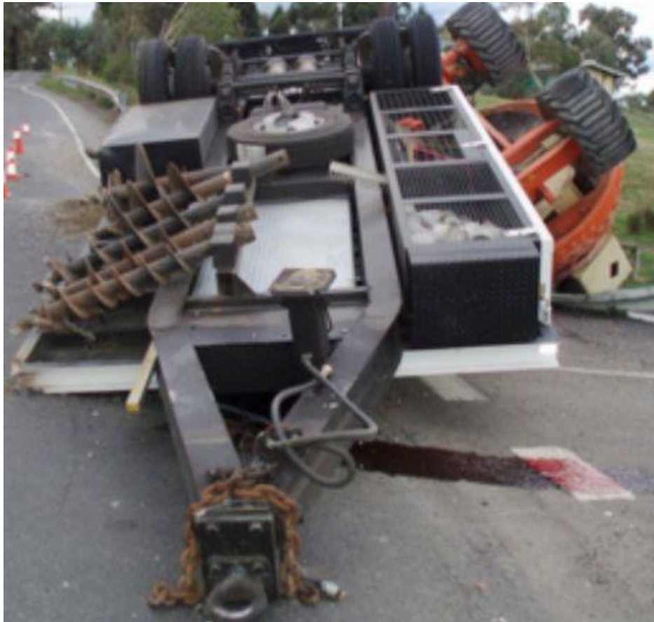
The overturned trailer and boomlift

A 13 tonne trailer carrying a self-propelled boom lift overturned as the towing vehicle, reportedly a dump truck, took a corner too fast in the town of Plenty, Victoria North East of Melbourne in Australia.