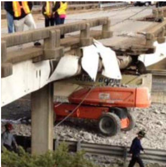
The bridge was damaged beyond repair

The bridge was built in 1957 and had a clearance of 13ft 10" or 4.2 metres. Thankfully no one was injured in the incident.