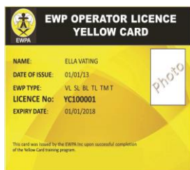
Front of Licence